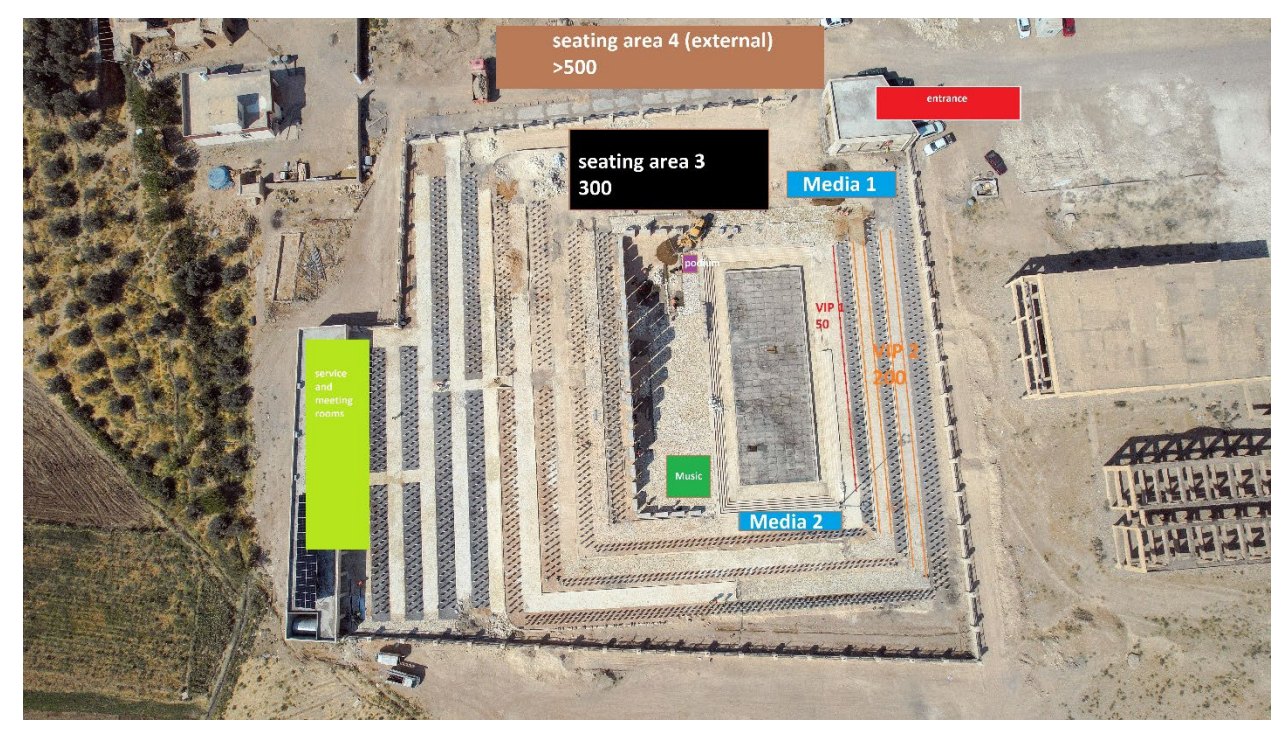
Event site map and media enclave locations