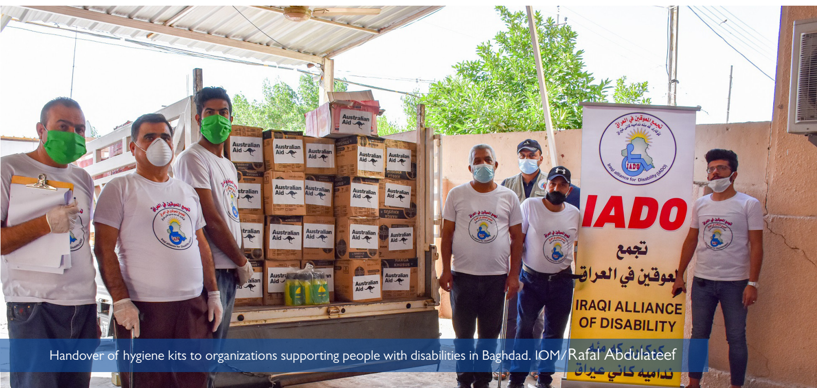
Handover of hygiene kits to organizations supporting people with disabilities in Baghdad.

In terms of aviation, international airports in Baghdad and Basra remain open for commercial flights following their re-opening by the Iraq Civil Aviation Authority (ICAA) on 23 July. Additionally, the airport in Erbil re-opened for commercial flights on 1 August.